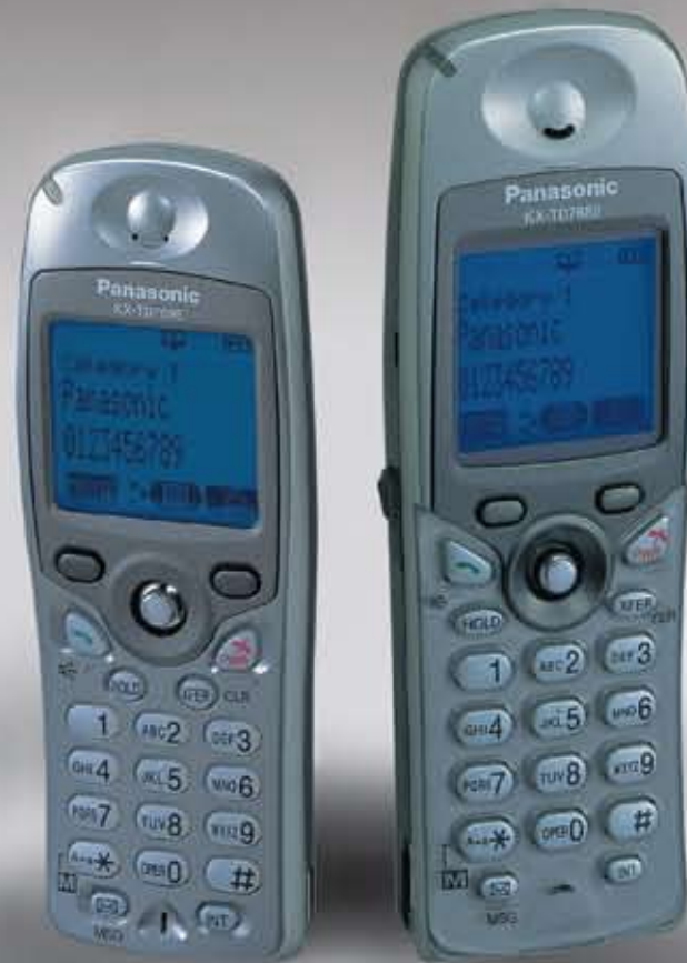
KX-TD7695 Compact Model

Whenever you get a call or touch a key, the LCD lights up in blue so you can see who's calling and easily operate the phone - even in the dark.