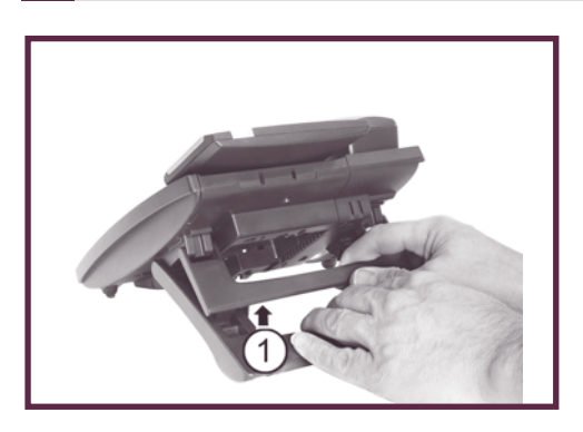
To adjust the viewing angle position: