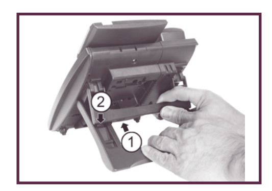
To set a higher viewing angle position: