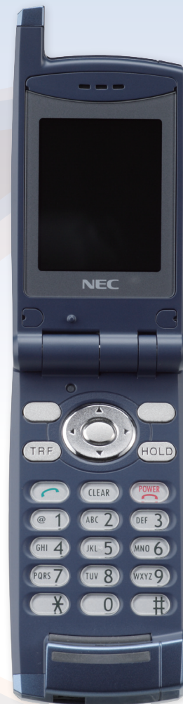
UNIVERGE Terminal MH250

For more information, visit necunified.com/wlan .