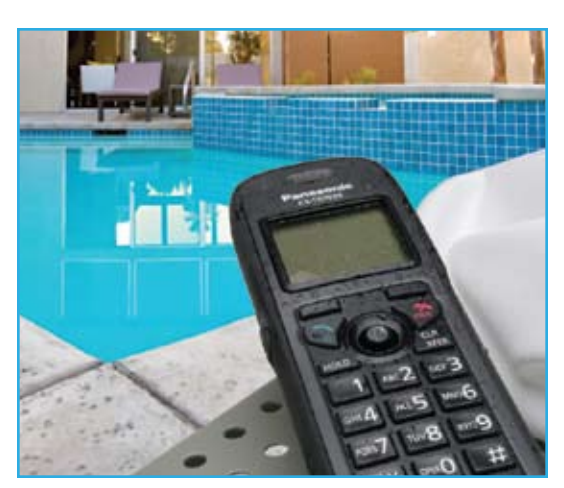
Dust & Splash Resistant