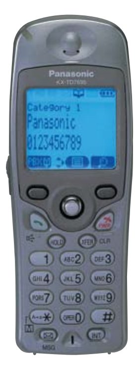
KX-TD7695 Compact Model