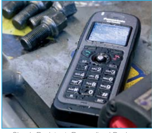
Shock-Resistant, Ruggedized Design

The KX-TD7696 boasts a large, 6-line, blue backlit LCD and includes all the features you'd expect such as Caller ID, personal and system speed dials, and a built-in 100-entry phone book and distinct ring/LED options. The handset includes an intuitive Graphical Icon Menu and dynamic Operation Guidance with Soft Keys and a Built-in Joystick.