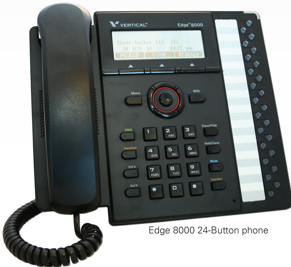
Edge 8000 24-Button phone

MBX IP can take advantage of T1 or PRI trunks to provide cost savings and functionality traditional analog trunks don't offer.