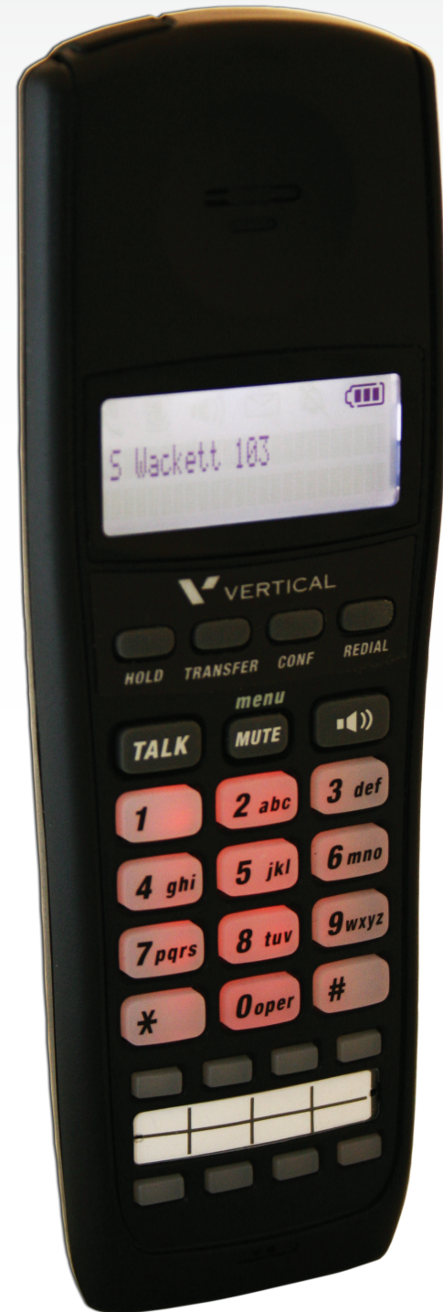
DECT cordless phone