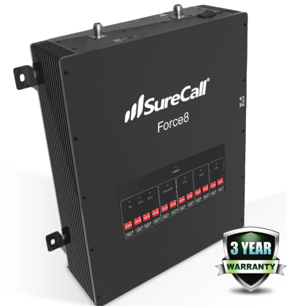
The SureCall Force8 Industrial Amplifier

* Performance and coverage area are dependent upon the strength of cell signal outside of the building and density of structure and materials inside of the building.